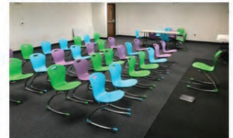
FBC at the Fields, Carrollton

Building or sprucing up? Visit us to schedule your free consultation!